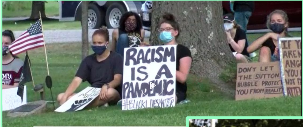
SPECTRUM NEWS BLACK LIVES MATTER MARCH HELD IN SUTTON TO OBSERVE